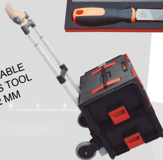
COD.50986 UNIVERSAL TROLLEY