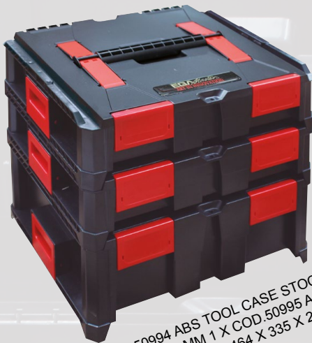
2 x COD.50994 ABS TOOL CASE STOCKABLE 464 X 335 X 142 MM 1 X COD.50995 ABS TOOL CASE STOCKABLE 464 X 335 X 212 MM