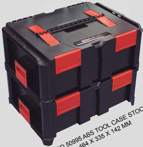
2 X COD. 50995 ABS TOOL CASE STOCKABLE 464 X 335 X 142 MM