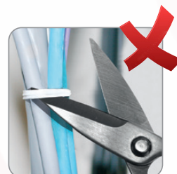
Scissors and knives damage the cables.