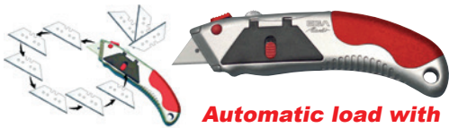
Automatic load with 10 blades