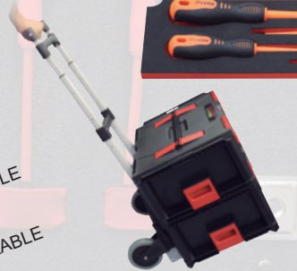
COD.50986 UNIVERSAL TROLLEY