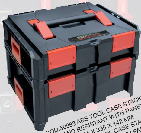
COD.50983 ABS TOOL CASE STACKABLE AND RESISTANT WITH PANEL 464 X 335 X 142 MM COD.50984 ABS TOOL CASE STACKABLE AND RESISTANT WITH PANEL 464 X 335 X 212 MM