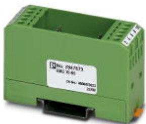
Custom circuit module, consisting of housing, MKDS 3 connection terminal blocks and PCB

Please be informed that the data shown in this PDF Document is generated from our Online Catalog. Please find the complete data in the user's documentation. Our General Terms of Use for Downloads are valid ( http://phoenixcontact.com/download )