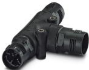
T distributor, QUICKON connection, number of positions: 4+PE, 2.5 mm 2 ... 6 mm 2 , 690 V, 40 A, black, Without QUICKON nut

Please be informed that the data shown in this PDF Document is generated from our Online Catalog. Please find the complete data in the user's documentation. Our General Terms of Use for Downloads are valid ( http://phoenixcontact.com/download )