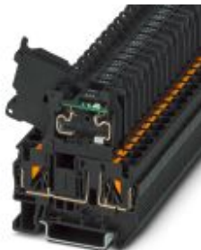
Lever-type fuse terminal block, black, for 5 x 20 mm G fuse inserts, with LED for 24 V AC/DC

Please be informed that the data shown in this PDF Document is generated from our Online Catalog. Please find the complete data in the user's documentation. Our General Terms of Use for Downloads are valid ( http://phoenixcontact.com/download )