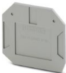
End cover, length: 52 mm, width: 2.2 mm, height: 47 mm, color: gray

Please be informed that the data shown in this PDF Document is generated from our Online Catalog. Please find the complete data in the user's documentation. Our General Terms of Use for Downloads are valid ( http://phoenixcontact.com/download )