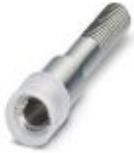
Female test connector, color: silver

Female test connector - PSBJ 3/13/4 - 0201304