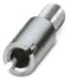
Female test connector, color: silver

Female test connector - PSB 3/10/4 - 0601292