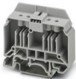
End clamp, width: 13 mm, material: PA, length: 53.3 mm, color: gray

Please be informed that the data shown in this PDF Document is generated from our Online Catalog. Please find the complete data in the user's documentation. Our General Terms of Use for Downloads are valid ( http://phoenixcontact.com/download )