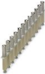
Fixed bridge, with knurled screws, pitch: 13 mm, number of positions: 12, color: silver

Please be informed that the data shown in this PDF Document is generated from our Online Catalog. Please find the complete data in the user's documentation. Our General Terms of Use for Downloads are valid ( http://phoenixcontact.com/download )