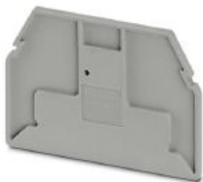
End cover, length: 53.3 mm, width: 2.2 mm, height: 37 mm, color: gray

Please be informed that the data shown in this PDF Document is generated from our Online Catalog. Please find the complete data in the user's documentation. Our General Terms of Use for Downloads are valid ( http://phoenixcontact.com/download )