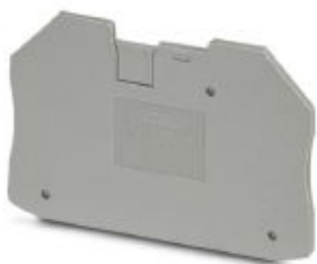
End cover, length: 65 mm, width: 2.2 mm, height: 50.4 mm, color: gray

Please be informed that the data shown in this PDF Document is generated from our Online Catalog. Please find the complete data in the user's documentation. Our General Terms of Use for Downloads are valid ( http://phoenixcontact.com/download )