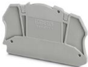
Cover, width: 2.2 mm

Please be informed that the data shown in this PDF Document is generated from our Online Catalog. Please find the complete data in the user's documentation. Our General Terms of Use for Downloads are valid ( http://phoenixcontact.com/download )