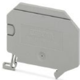
Partition plate, length: 62.1 mm, width: 2.2 mm, height: 52.5 mm, color: gray

Please be informed that the data shown in this PDF Document is generated from our Online Catalog. Please find the complete data in the user's documentation. Our General Terms of Use for Downloads are valid ( http://phoenixcontact.com/download )