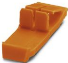
Latching, length: 29.8 mm, width: 10 mm, number of positions: 2, color: orange

Please be informed that the data shown in this PDF Document is generated from our Online Catalog. Please find the complete data in the user's documentation. Our General Terms of Use for Downloads are valid ( http://phoenixcontact.com/download )