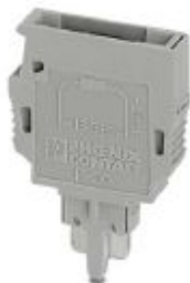
Component connector, with diode 1N4007, length: 24.2 mm, width: 5.2 mm, height: 33.3 mm, number of positions: 1, color: gray

Please be informed that the data shown in this PDF Document is generated from our Online Catalog. Please find the complete data in the user's documentation. Our General Terms of Use for Downloads are valid ( http://phoenixcontact.com/download )