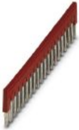
Plug-in bridge, pitch: 6.2 mm, width: 122.3 mm, number of positions: 20, color: red

Please be informed that the data shown in this PDF Document is generated from our Online Catalog. Please find the complete data in the user's documentation. Our General Terms of Use for Downloads are valid ( http://phoenixcontact.com/download )