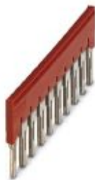
Plug-in bridge, pitch: 8.2 mm, width: 80.3 mm, number of positions: 10, color: red

Please be informed that the data shown in this PDF Document is generated from our Online Catalog. Please find the complete data in the user's documentation. Our General Terms of Use for Downloads are valid ( http://phoenixcontact.com/download )