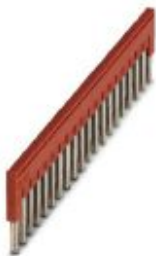
Plug-in bridge, pitch: 5.2 mm, number of positions: 20, color: red

Please be informed that the data shown in this PDF Document is generated from our Online Catalog. Please find the complete data in the user's documentation. Our General Terms of Use for Downloads are valid ( http://phoenixcontact.com/download )