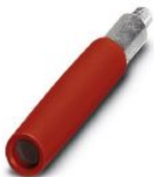
Female test connector, color: red

Please be informed that the data shown in this PDF Document is generated from our Online Catalog. Please find the complete data in the user's documentation. Our General Terms of Use for Downloads are valid ( http://phoenixcontact.com/download )