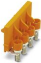
Switching jumper, pitch: 8.2 mm, width: 31.7 mm, number of positions: 4, color: orange

Please be informed that the data shown in this PDF Document is generated from our Online Catalog. Please find the complete data in the user's documentation. Our General Terms of Use for Downloads are valid ( http://phoenixcontact.com/download )