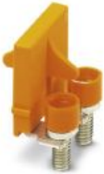
Switching jumper, pitch: 8.2 mm, width: 15.3 mm, number of positions: 2, color: orange

Please be informed that the data shown in this PDF Document is generated from our Online Catalog. Please find the complete data in the user's documentation. Our General Terms of Use for Downloads are valid ( http://phoenixcontact.com/download )