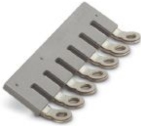
Insertion bridge, pitch: 11.1 mm, number of positions: 7, color: gray

Please be informed that the data shown in this PDF Document is generated from our Online Catalog. Please find the complete data in the user's documentation. Our General Terms of Use for Downloads are valid ( http://phoenixcontact.com/download )