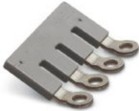
Insertion bridge, pitch: 11.1 mm, number of positions: 4, color: gray

Please be informed that the data shown in this PDF Document is generated from our Online Catalog. Please find the complete data in the user's documentation. Our General Terms of Use for Downloads are valid ( http://phoenixcontact.com/download )