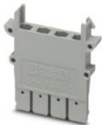
Connector housing, with securing pins, length: 31.6 mm, width: 5.2 mm, height: 31.7 mm, number of positions: 4, color: gray

Please be informed that the data shown in this PDF Document is generated from our Online Catalog. Please find the complete data in the user's documentation. Our General Terms of Use for Downloads are valid ( http://phoenixcontact.com/download )