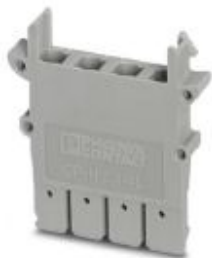
Connector housing, length: 31.6 mm, width: 5.2 mm, height: 31.7 mm, number of positions: 4, color: gray

Please be informed that the data shown in this PDF Document is generated from our Online Catalog. Please find the complete data in the user's documentation. Our General Terms of Use for Downloads are valid ( http://phoenixcontact.com/download )