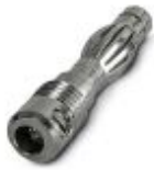
Test plugs, color: silver