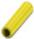
Insulating sleeve, color: yellow