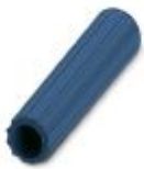
Insulating sleeve, color: blue