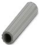
Insulating sleeve, color: gray