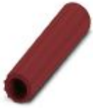
Insulating sleeve, color: red