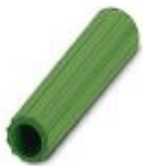
Insulating sleeve, color: green