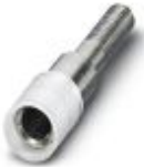
Female test connector, color: transparent

Female test connector - PSBJ 4/15/6 FARBLOS - 0303419