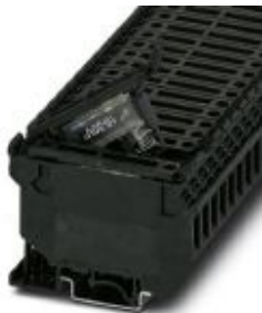
Fuse terminal block for cartridge fuse insert, cross section: 0.2 - 4 mm 2 , AWG: 26 - 10, width: 8.2 mm, color: black

Please be informed that the data shown in this PDF Document is generated from our Online Catalog. Please find the complete data in the user's documentation. Our General Terms of Use for Downloads are valid ( http://phoenixcontact.com/download )