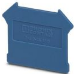
End cover, length: 42.5 mm, width: 1.8 mm, height: 47 mm, color: blue

Please be informed that the data shown in this PDF Document is generated from our Online Catalog. Please find the complete data in the user's documentation. Our General Terms of Use for Downloads are valid ( http://phoenixcontact.com/download )