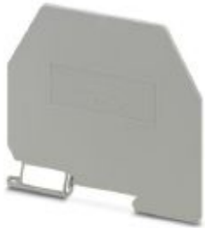
Partition plate, length: 99 mm, width: 2 mm, height: 90 mm, color: gray

Please be informed that the data shown in this PDF Document is generated from our Online Catalog. Please find the complete data in the user's documentation. Our General Terms of Use for Downloads are valid ( http://phoenixcontact.com/download )