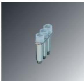
Fixed bridge, pitch: 5 mm, number of positions: 3, color: silver

Please be informed that the data shown in this PDF Document is generated from our Online Catalog. Please find the complete data in the user's documentation. Our General Terms of Use for Downloads are valid ( http://phoenixcontact.com/download )