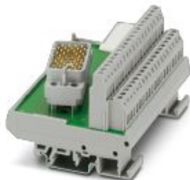
Interface module, connection 1: Screw connection, connection 2: ELCO connector 1x 38-position (Pin strip, Type 8016, right)

Please be informed that the data shown in this PDF Document is generated from our Online Catalog. Please find the complete data in the user's documentation. Our General Terms of Use for Downloads are valid ( http://phoenixcontact.com/download )