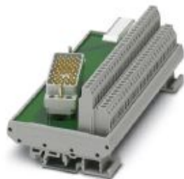
Interface module, connection 1: Screw connection, connection 2: ELCO connector 1x 56-position (Pin strip, Type 8016, right)

Please be informed that the data shown in this PDF Document is generated from our Online Catalog. Please find the complete data in the user's documentation. Our General Terms of Use for Downloads are valid ( http://phoenixcontact.com/download )