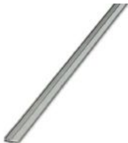
Continuous plug-in bridge, length: 500 mm, color: gray

Please be informed that the data shown in this PDF Document is generated from our Online Catalog. Please find the complete data in the user's documentation. Our General Terms of Use for Downloads are valid ( http://phoenixcontact.com/download )