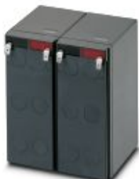
Replacement battery for UPS-BAT/VRLA... energy storage

Please be informed that the data shown in this PDF Document is generated from our Online Catalog. Please find the complete data in the user's documentation. Our General Terms of Use for Downloads are valid ( http://phoenixcontact.com/download )