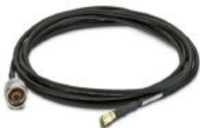
The figure shows a version of the product

Antenna cable, outside diameter: 5 mm (0.2 in.), inner conductor: solid, attenuation: 0.4 / 0.5 / 0.6 dB at 0.9 / 2.4 / 5.8 GHz, connection: N (male) -> RSMA (male), cable length: 0.5 m (1.6 ft.)