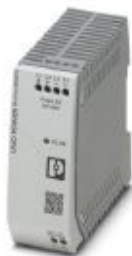
Primary-switched UNO POWER power supply for DIN rail mounting, input: 1-phase, output: 24 V DC/60 W

Please be informed that the data shown in this PDF Document is generated from our Online Catalog. Please find the complete data in the user's documentation. Our General Terms of Use for Downloads are valid ( http://phoenixcontact.com/download )