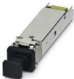
Gigabit SFP module for transmission up to 30 km with a wavelength of 1310 nm.

Please be informed that the data shown in this PDF Document is generated from our Online Catalog. Please find the complete data in the user's documentation. Our General Terms of Use for Downloads are valid ( http://phoenixcontact.com/download )