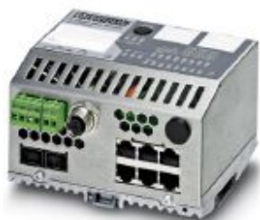
Ethernet Smart Managed Compact Switch with six 10/100/1000 Mbps RJ45 ports and two 1000 Mbps SFP slots

Please be informed that the data shown in this PDF Document is generated from our Online Catalog. Please find the complete data in the user's documentation. Our General Terms of Use for Downloads are valid ( http://phoenixcontact.com/download )