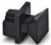
Dust protection caps for RJ45 socket

Dust protection - FL RJ45 PROTECT CAP - 2832991