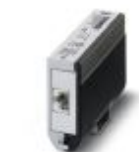
Surge protection in accordance with Class E A (CAT6 A ), for Gigabit Ethernet (up to 10 Gbps), token ring, FDDI/ CDDI, ISDN, and DS1. Suitable for Power over Ethernet (PoE+) "Mode A" and "Mode B". RJ45 attachment plug with separate grounding cable and ground connection snap-on foot for NS 35 DIN rails.

Surge protection device - DT-LAN-CAT.6+ - 2881007