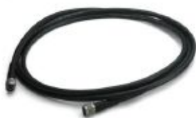
The figure shows a version of the product

Antenna cable, outside diameter: 10 mm (0.4 in.), inner conductor: stranded, attenuation: 4.3 / 8.3 / 14.8 dB at 0.9 / 2.4 / 5.8 GHz, connection: 2 x N (male), cable length: 15 m (50 ft.)