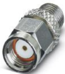
Antenna adapter, frequency range: 0.3 GHz ... 6 GHz, connection: RSMA (male) -> SMA (female)

Please be informed that the data shown in this PDF Document is generated from our Online Catalog. Please find the complete data in the user's documentation. Our General Terms of Use for Downloads are valid ( http://phoenixcontact.com/download )