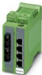
Ethernet Lean Managed Switch with four 10/100 Mbps RJ45 ports and two 10/100 Mbps FX-SC multi-mode ports

Please be informed that the data shown in this PDF Document is generated from our Online Catalog. Please find the complete data in the user's documentation. Our General Terms of Use for Downloads are valid ( http://phoenixcontact.com/download )