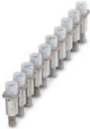
Fixed bridge, pitch: 8.2 mm, number of positions: 10, color: silver

Please be informed that the data shown in this PDF Document is generated from our Online Catalog. Please find the complete data in the user's documentation. Our General Terms of Use for Downloads are valid ( http://phoenixcontact.com/download )