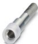
Female test connector, color: silver

Female test connector - PSBJ 3/13/4 - 0201304