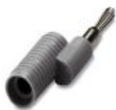
Reducing plug, color: gray