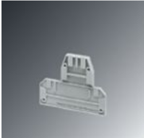
Spacer plate, to compensate for level offsets, length: 67 mm, width: 2.5 mm, color: gray

Please be informed that the data shown in this PDF Document is generated from our Online Catalog. Please find the complete data in the user's documentation. Our General Terms of Use for Downloads are valid ( http://phoenixcontact.com/download )